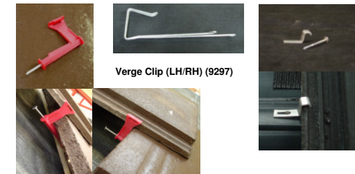
Slate Clip (9240 (incl. nails))

Double battening clip (9204) Secured with two 40mm x 2.65mm aluminium alloy nails.