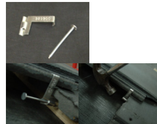
Slate Clip (9299 (inc. nails))