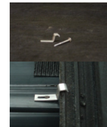
Eave Clip and Nails (9296 and 9332)