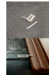
Eave Clip and Nails (9527 and 9332)