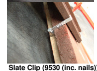
Slate Clip (9530 (inc. nails))