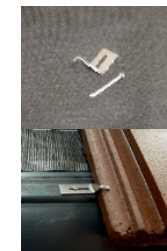
Eave Clip and Nails (9527 and 9332)