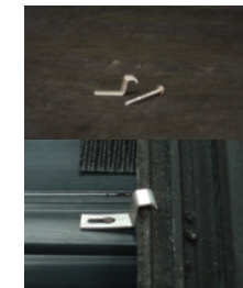
Eave Clip and Nails (9296 and 9332)