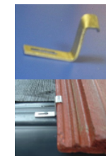
Eave Clip and Nails (9186 and 9332)

For all sales enquiries/orders contact our CUSTOMER SERVICE HOTLINE Tel. 08705 601000 / Fax. 08705 642742 For all technical enquiries contact our TECHNICAL SOLUTIONS HOTLINE Tel. 08708 702595 / Fax. 08708 702596