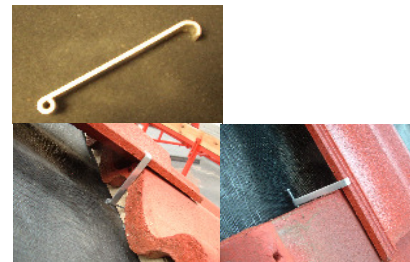
Tile Clip and Nails (9246 and 9333)