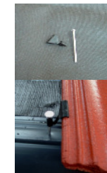
Eave Clip and Nails (9287)