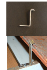
Eave Clip and Nails (9178 & 9332)