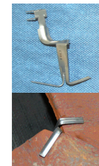
Tile Clip (9637)