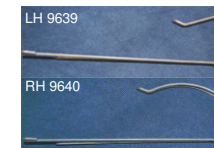
Verge Clip (LH/RH) (9639/9640)