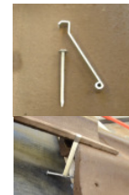
Tile Clip and Nails (9177 and 9333)