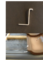
Eave Clip and Nails (9178 and 9332)