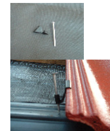
Eave Clip and Nails (9287)

For all sales enquiries/orders contact our CUSTOMER SERVICE HOTLINE Tel. 08705 601000 / Fax. 08705 642742 For all technical enquiries contact our TECHNICAL SOLUTIONS HOTLINE Tel. 08708 702595 / Fax. 08708 702596