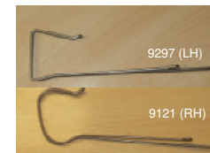
Verge Clip (LH/RH) (9297/9121)