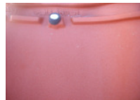
60 x 2.65 mm Ring-Shanked Tile Nail with Washer (9330)