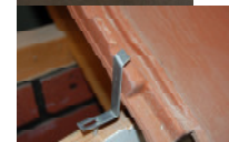
Eave Clip and Nails (9178 and 9332)