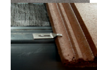
Eave Clip and Nails (9527 and 9332)