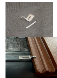
Eave Clip and Nails (9527 and 9332)