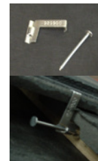
Tile Clip (9299 (incl. nails))